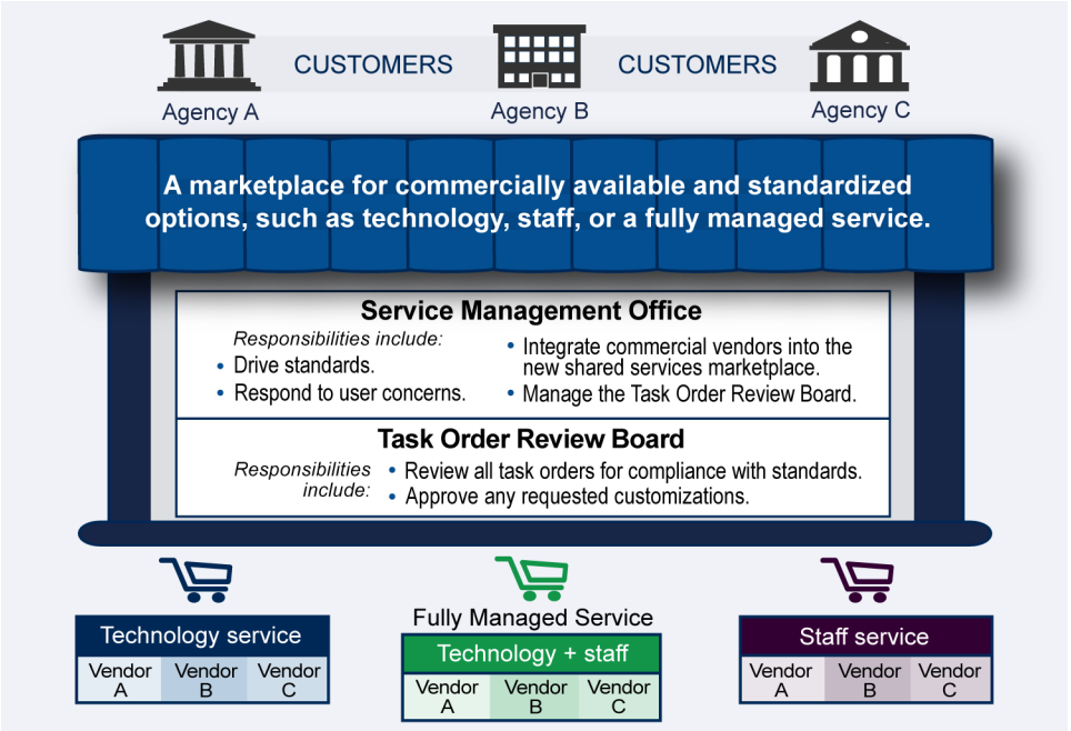
Figure 3: Office of Management and Budget and General Service Administration’s New Model for the Shared Services Marketplace

Source: GAO analysis of Office of Management and Budget (OMB) and General Services Administration (GSA) planning documents. | GAO-19-94