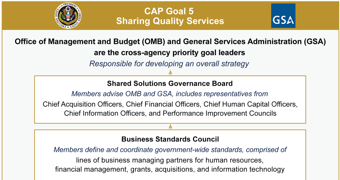
Figure 2: Description of Entities Involved with Developing Shared Services Strategy, Policy, and Standards

Source: GAO analysis of President's Management Agenda, Shared Services Cross-Agency Priority Goal Action Plan. | GAO-19-94