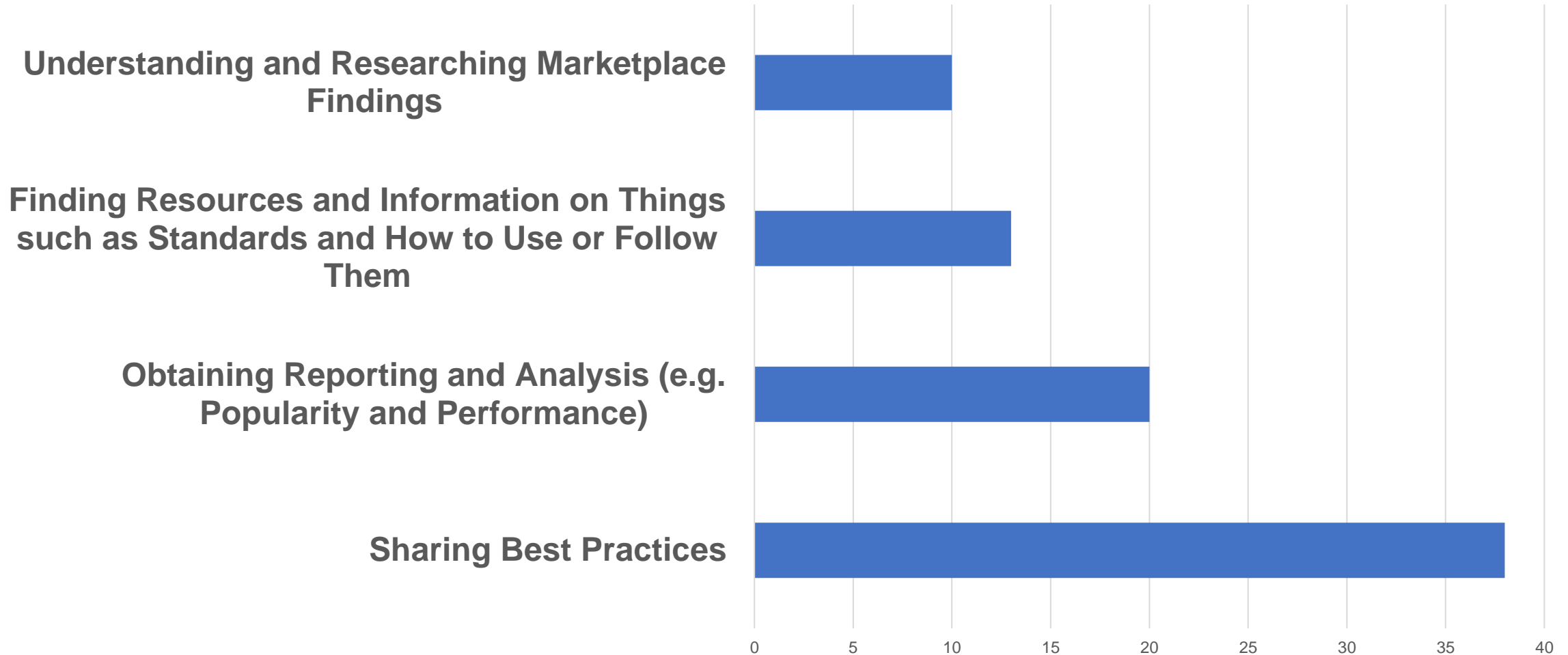
Number of Suggestions Aligned with the Four Priority Zones